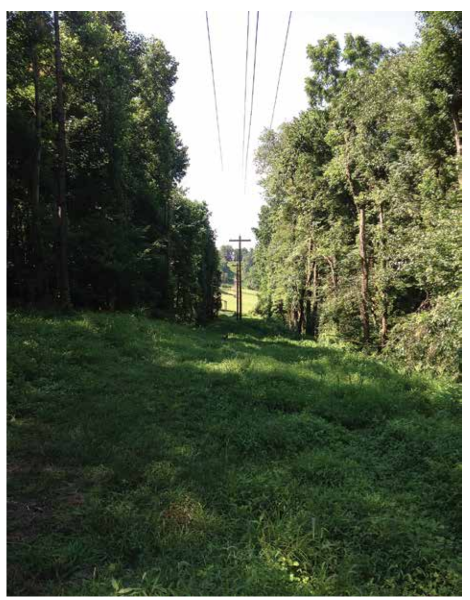
CLEAR VIEW: Following maintenance of a right of way near the Hanover Substation, members can now see a clearing where the co-op's power lines can run uninhibited, with less chance of tree damage or interference.

"Maintaining a beautiful landscape is important to Adams Electric, but our main priority is to keep your lights on," says Rich Redding, right-of-way coordinator. "Planting the right tree in